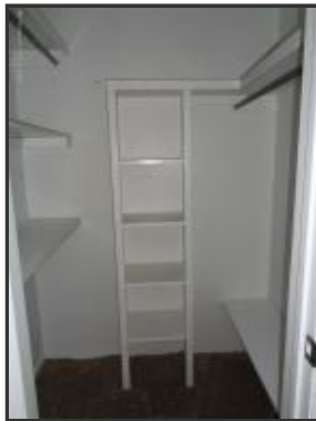
Nice walk-in closet